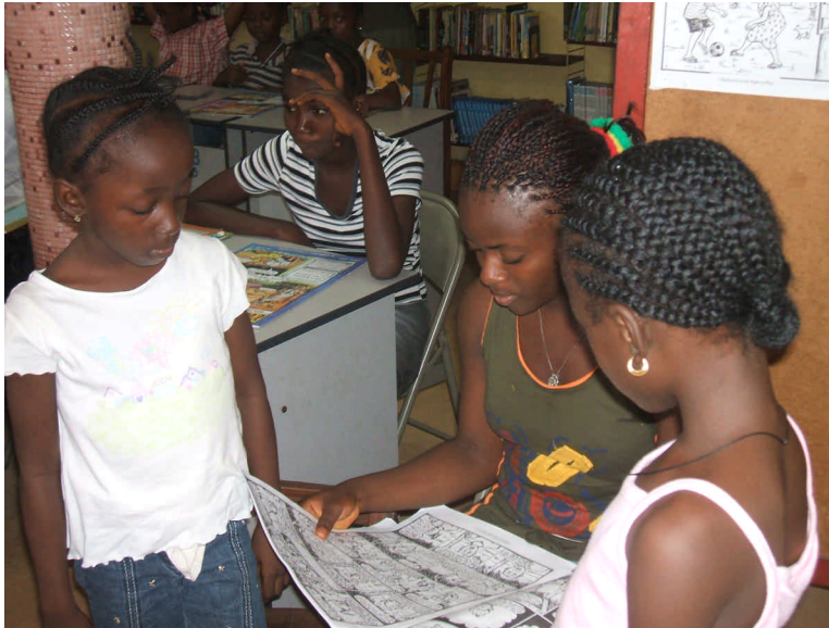
Summer Reading Room 2008 session at the Children's' Library in Freetown