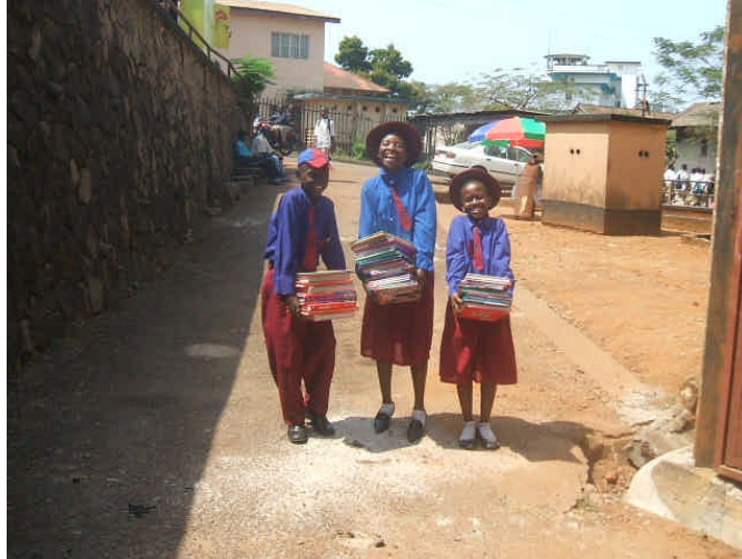
Happy children who have received books from SALBOT