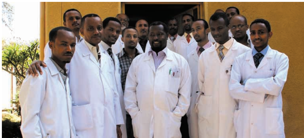
On the Left: ESS Instructors Course, Gondar