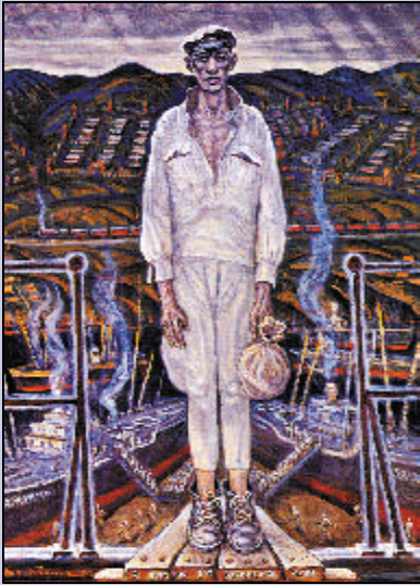
"I remember the port in Vanino,"

Sabre Foundation, in collaboration with Ukrainian partner Sabre-Svitlo, will distribute 1,400 copies of "The Gulag Collection" to libraries and other recipient institutions throughout the countries of the former Soviet Union.